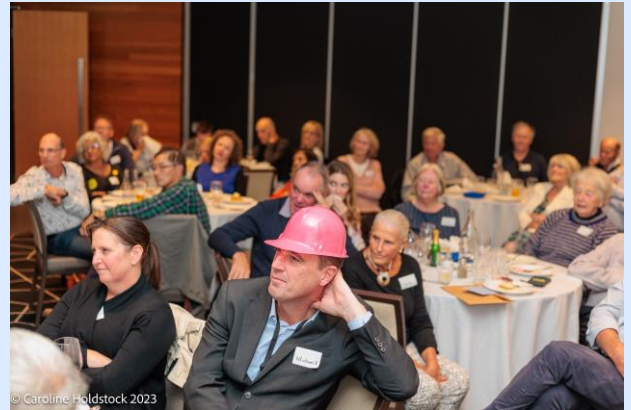
An attentive audience for the awards presentations