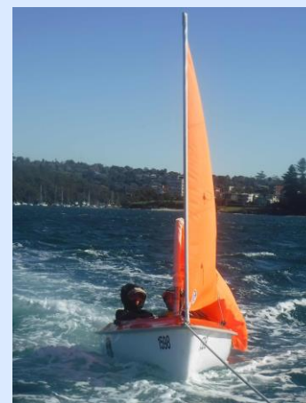
Ralph Newman is towed back to the dock with a broken mast