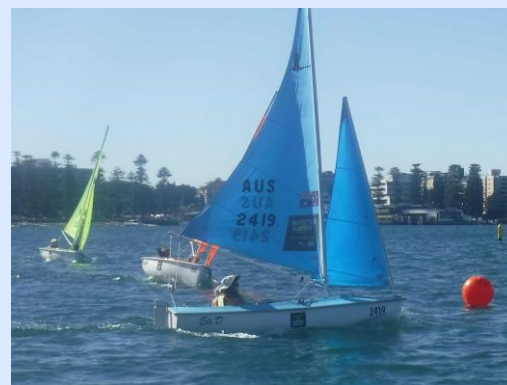
The fleet preparing to cross the start line