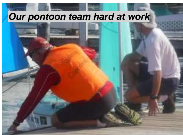
Our pontoon team hard at work