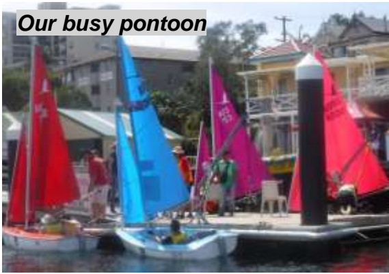
Our busy pontoon