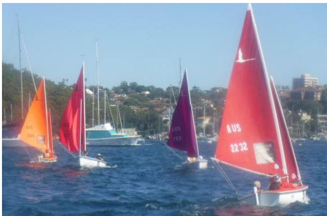
Jockeying for position in Race 1