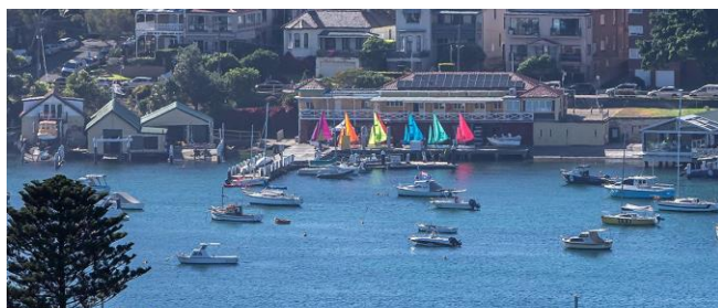
Boats set up on the Pontoon

Our Race Officer Crew, Bruce and Pam, arrived and delivered a race briefing to the assembled crews and then embarked on Charlie's Chariot to pick up the Race Boat, Carlisle. The crew of Carlisle swapped boats, found the perfect spot for a Race-Start and started the instructions for a course laying. In the meantime, the boats were taken to the pontoon and launched, so that the crews could safely make their way across the bay to the official Race Start. What a fantastic team effort.