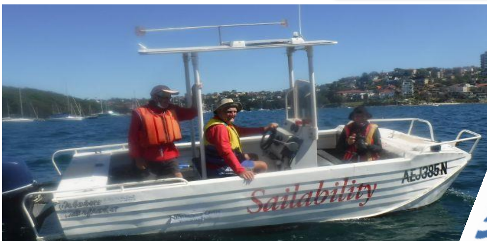
Support Boat Crew on Charlie's Chariot