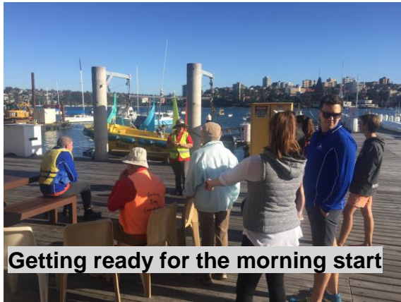
Getting ready for the morning start

The morning dawned cold and quite still, so we decided to go ahead with sailing in spite of the wind in the forecast. Maybe we'd be lucky and the wind would hold back until lunchtime?