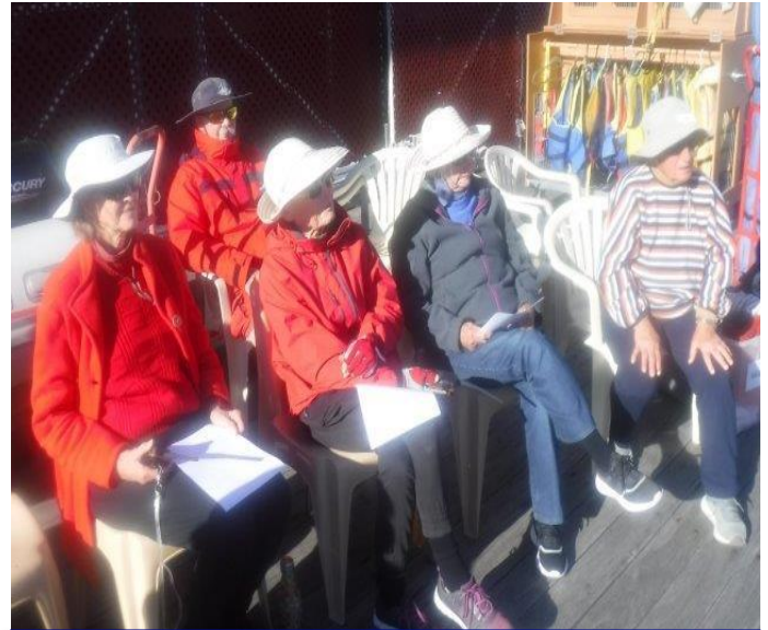
Volunteer Group Training Lecture at the Dock