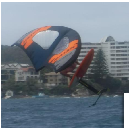
Air Foiling in Manly Cove