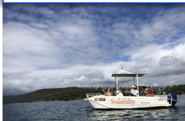
Charlie’s Chariot Crew