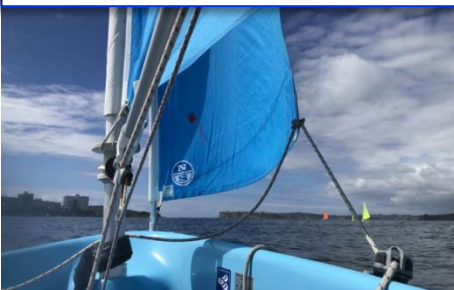
Limor’s photo inside Eli D