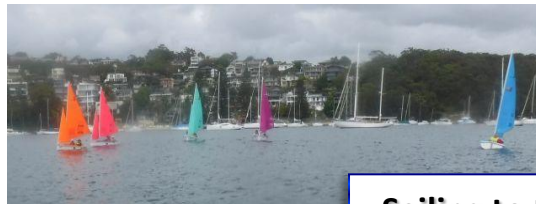
Sailing to the Race Course

The racing was extremely close, and the improvement in sailing and rigging skills is quite amazing since we have started informal racing on sailing days. Helen was left in her element on shore, arranging articles into the trolley to reduce the number of times we need to enter the boat room to pick up necessities; they are now all comfortably encased in the trolley drawers. Thanks so much for this, Helen! After the race, all boats were lifted out and stored away ready for our next sailing day. Apologies to Monique, who arrived too late to join the race.